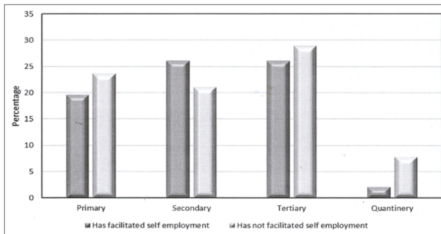
Figure 2: Level of healthcare in which occupational therapists do and do not facilitate self-employment in people with disabilities

pists feel competent in facilitating self-employment. Despite this, 43% of participants claimed they had experience in facilitating self-employment in PWDs in that they had given advice, had run income generation projects and had done prevocational training as their setting had allowed for this type of vocational rehabilitation. It would appear that these occupational therapists are not documenting their endeavours in this regard, as was noted in the literature section.